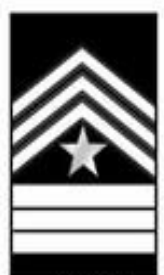
CADET SERGEANT MAJOR