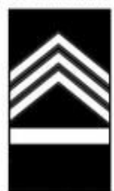
CADET STAFF SERGEANT