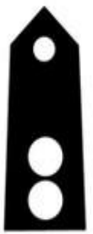
CADET FIRST LIEUTENANT