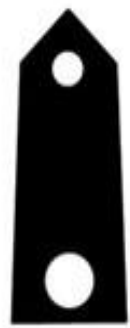
CADET SECOND LIEUTENANT