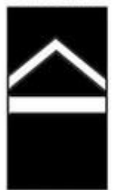
CADET PRIVATE FIRST CLASS