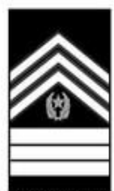
CADET COMMAND SERGEANT MAJOR