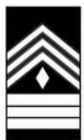
CADET FIRST SERGEANT