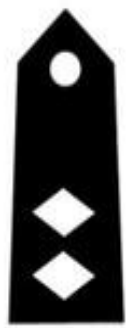
CADET LIEUTENANT COLONEL